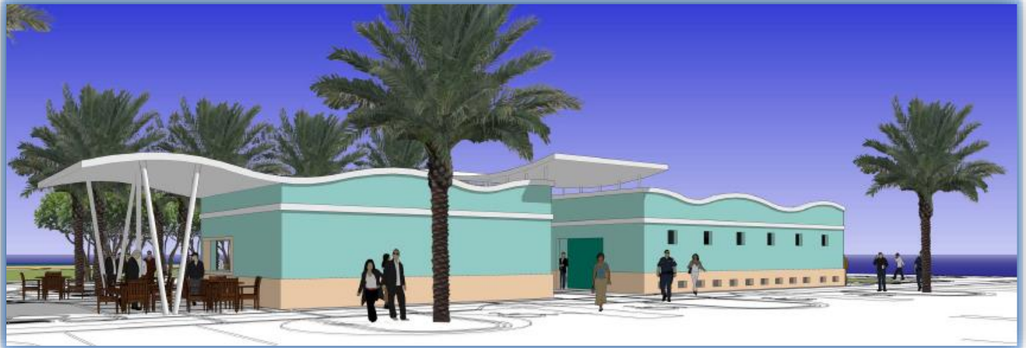
Rendering of the South Beach Park Building